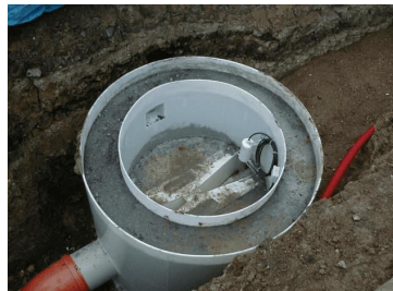
Socket Pashall flume